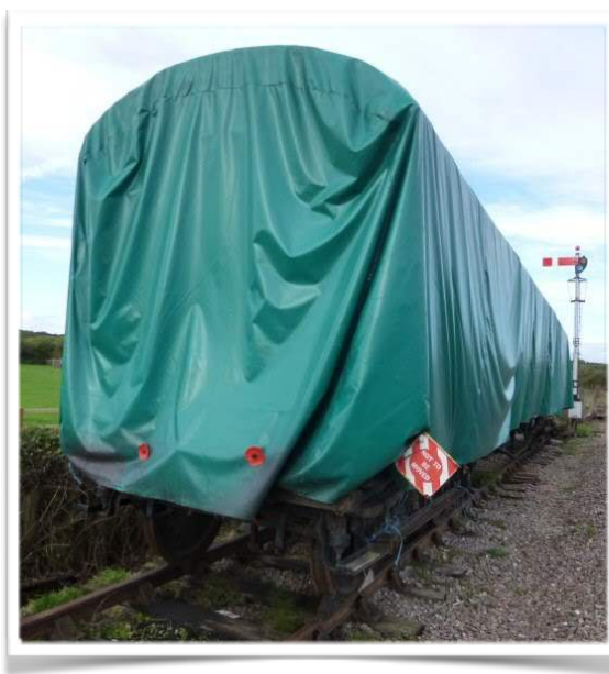
3639 is currently stored at Williton. It carried poppies in November for Remembrance Sunday.

We are aiming to complete the feasibility study by the end of March. If this is favourable, we will work towards funding application by the end of 2014, with the aim of completing it in time for the centenary of 3639 coming out of Swindon works.